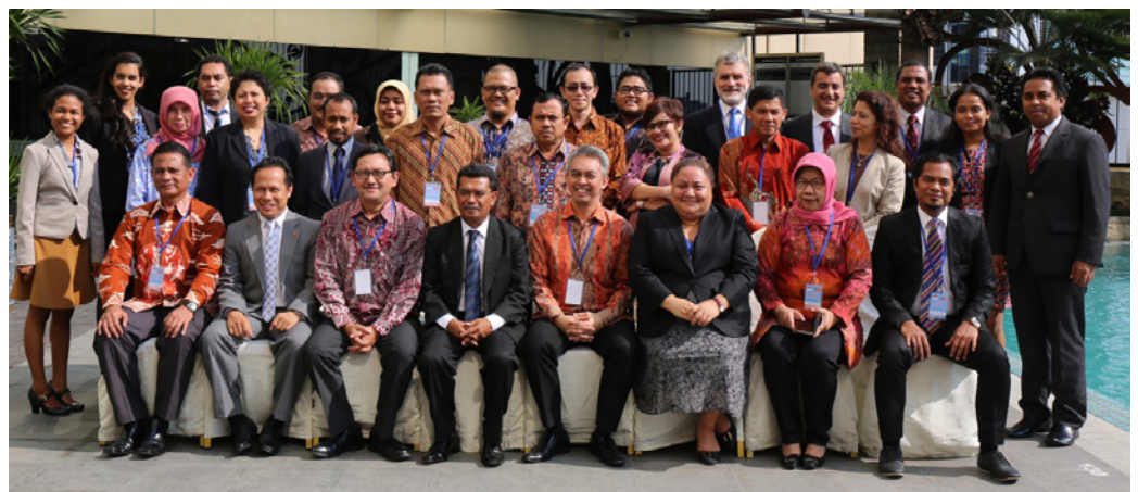
Consultation Meeting between Timor-Leste and Indonesia

In the initial consultations on maritime boundaries, Indonesia and Timor-Leste jointly developed a set of Principles and Guidelines and a Work Plan for the negotiations. Both States affirmed that the position of a permanent maritime boundary should be negotiated in accordance with international law, particularly UNCLOS. Formal negotiations on maritime boundaries are expected to begin in March 2016.