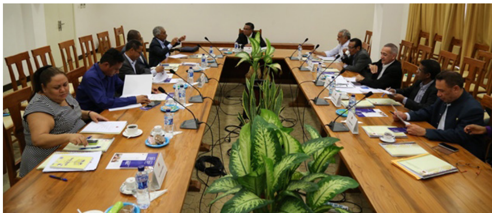
Meeting of the Consultative Commission of the Government of Timor-Leste on maritime boundaries

Despite that obligation, Australia has relied on the 'moratorium' clause under CMATS and is currently unwilling to negotiate permanent maritime boundaries with Timor-Leste. Due to Australia's carve-out of the maritime boundary jurisdiction of international courts, a permanent maritime boundary with Australia can only be achieved through bilateral negotiations.